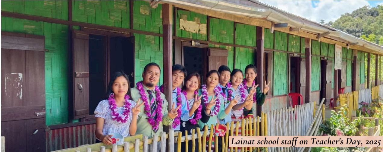
Lainat school staff on Teacher's Day, 2025