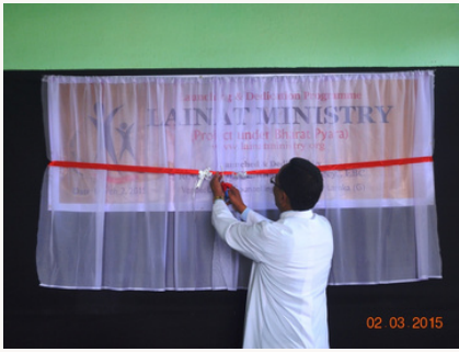
Photo Gallery- Lainat Ministry through the years